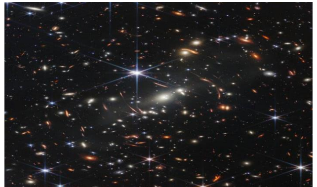
(The farthest cosmos pictured by telescope)

♪ ♪ Along our Earth-Loving Amicable Way two travellers pray to lovely field flowers, remembering people's distress, hoping recovery, to all, wishing happiness, health, success, security and a calm family.